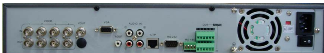
DS-7004HI Rear Panel