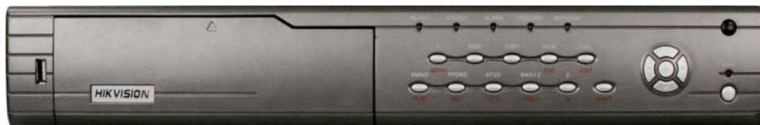
DS-7000HI Front Panel

HIKVISION DS-7000HI series network digital video recorder is the 3 rd generation excellent digital surveillance product. It uses the Real Time OS and embedded MCU. It supports both features of digital video recorder (DVR) and digital video server (DVS). It can work stand-alone or be used to build a powerful network, widely used in surveillance fields.