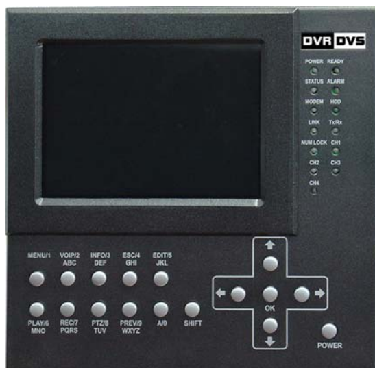
DS-8000AHLI Series Front Panel