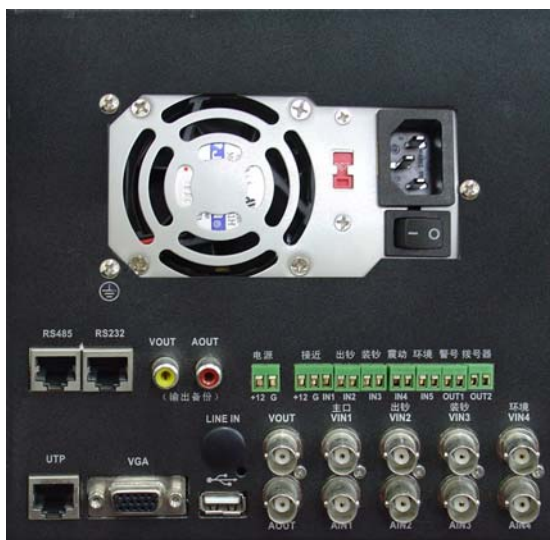
DS-8004AHI/AHLI Rear Panel