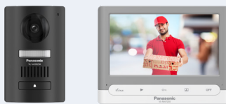
Door Station VL-VA502SX Main Monitor Station VL-MA72SX