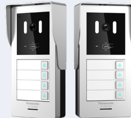
Lobby Station VL-VA514SX