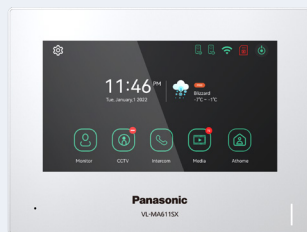
Main Monitor Station VL-MA611SX