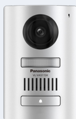
Door Station VL-VA511SX