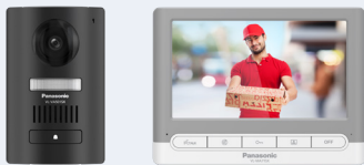
Door Station VL-VA502SX Main Monitor Station VL-MA71SX