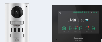
Door Station VL-VA504SX Room Monitor VL-MA74SX